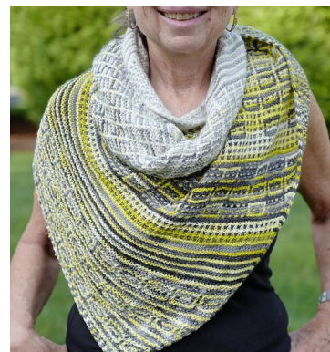
Straight on the Bias →